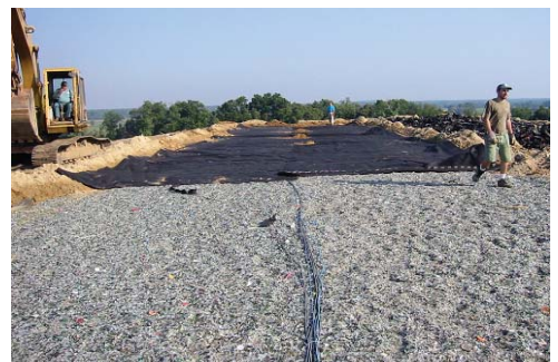
Researchers at this bioreactor landfill are testing the liquids distribution system using permeable blankets built into the lifts.