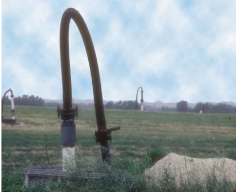
Gas collection wells at modern landfills protect public health by preventing methane from migrating off site.

When MSW is disposed of in a landfill, naturally occurring microorganisms (bacteria) degrade the waste. The amount of water in and the temperature of the MSW control the rate of degradation. This process turns the organic portion of the waste into methane (a primary constituent of natural gas) and carbon dioxide in about equal proportions. The degradation process also generates very small quantities of organic compounds.