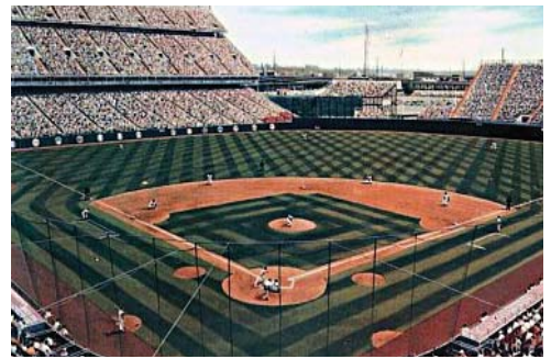
Mile High Stadium near Denver, Colorado is an example of a Category 3 post-closure use of a landfill.