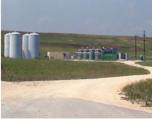
A modern municipal solid waste landfill with a gas collection and energy recovery system.

Regardless of where we live, work, or play, we generate trash. According to the United States Environmental Protection Agency (EPA), American's generated 254.7 million tons of municipal solid waste (MSW) in 2005 and more than half (138.3 million tons) was disposed of in landfills. 1