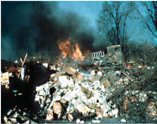
Old landfills used open burning to reduce space, but this also created air pollution.

In about 30 years, landfills changed from little more than holes in the ground to highly engineered, state-of-the-art containment systems requiring large capital expenditures. Typically, older landfills were designed by excavating a hole or trench, filling the excavation with trash, and covering the trash with soil. In most instances, the waste was placed directly on the underlying soils without a barrier or containment layer (liner) that prevented leachate (water percolating through the waste and picking up contaminants) from moving out of the landfill and contaminating groundwater. 6