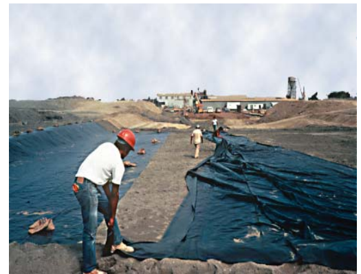
Synthetic materials can be used as landfill liners to prevent contamination of groundwater resources.

Waste is placed directly above the leachate collection system in layers. Delivered waste is placed on the working face that is maintained as small as possible to control odors and vectors. Heavy, steel-wheeled compactors move the waste into the working face to reduce the waste's volume.