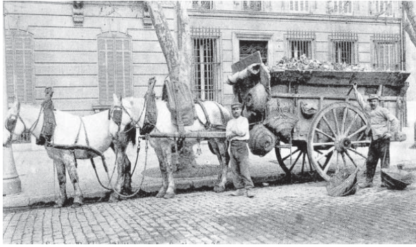
Early efforts at waste collection in cities consisted of horse-drawn wagons.

The first federal legislation addressing solid waste management was the Solid Waste Disposal Act of 1965 (SWDA) that created a national office of solid waste. By the mid-1970s, all states had some type of solid waste management regulations. However, the contents of these regulations varied widely. During this time, many states' laws banned the open burning of waste at dumps and began replacing them with sanitary landfills. In addition, some states required disposal facilities to obtain permits and meet minimal design and operational standards.