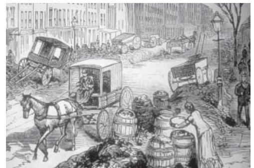
In the late 1860s, garbage was placed in leaking barrels on the street edge and picked through by scavengers and otherwise left for animals.

In 1935, the precursor to the modern landfill was started in California where waste was thrown into a hole in the ground that was periodically covered with dirt. The American Society of Civil Engineers in 1959 published the first guidelines for a "sanitary landfill" that suggested compacting waste and covering it with a layer of soil each day to reduce odors and control rodents.