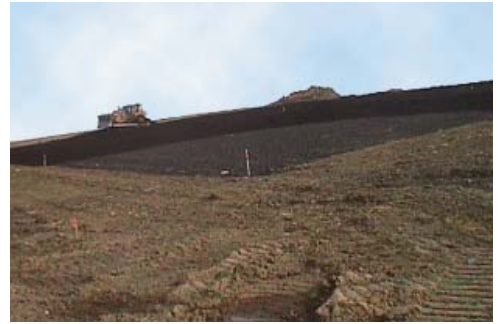
Researchers at this bioreactor landfill are testing the use of biocovers as an alternative cap system.