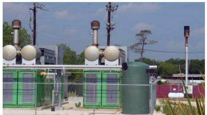
Gas collection systems at modern landfills can be used to generate electricity to supply energy to local communities.

According to recent EPA studies, modern landfills generate significantly lower concentrations of NMOCs than older sites. Of 48 NMOCs regulated by federal Clean Air Act rules, 58 percent of them are one to three orders of magnitude lower (an order of magnitude is a ten-fold decrease) in concentration in modern landfills than in older landfills. In fact, 5 of 28 NMOC compounds were not detected at modern landfills, but were present in high concentrations in older landfills. Since comparable data are from test programs conducted in the late 1980s, older landfills are likely to have higher concentrations of NMOCs than modern landfills.