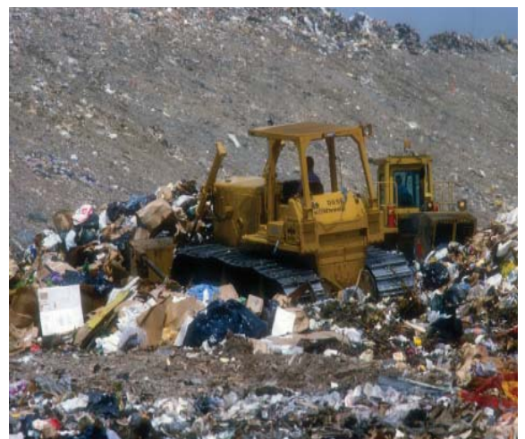
Compactors are used on the working face of landfills to move garbage and reduce the waste's volume.

In short, the engineered systems in a modern landfill ensure protection of human health and the environment by containing leachate that can contaminate groundwater, preventing the infiltration of precipitation that generates leachate after closure of the landfill, and collecting landfill gas that can be used as an energy source or destroyed.