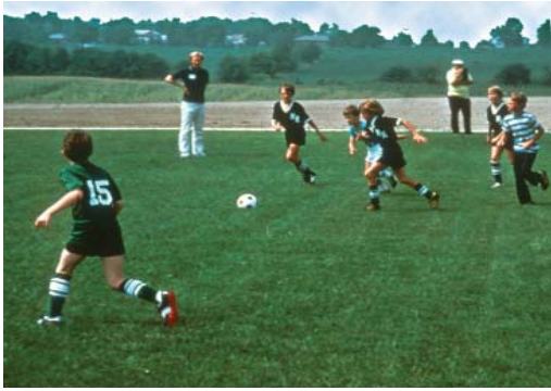
Category 2 uses for closed landfills include children's playgrounds such as this soccer field.

Category 2 uses are more intensive and are typically characterized by not having major structures, but may have utilities, light structures, or paving. Examples are: